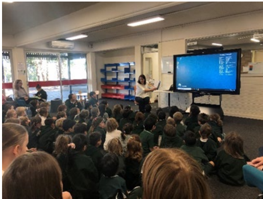
Reading "A Speedy Sloth"