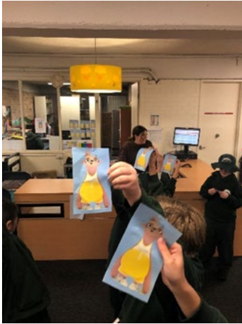
Finding A Sloth