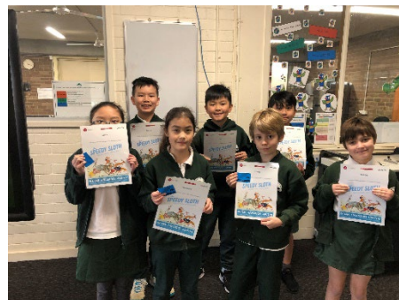
Yr 5 Storytellers