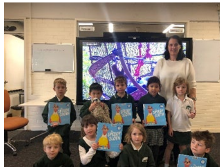
Kindy Children with the book