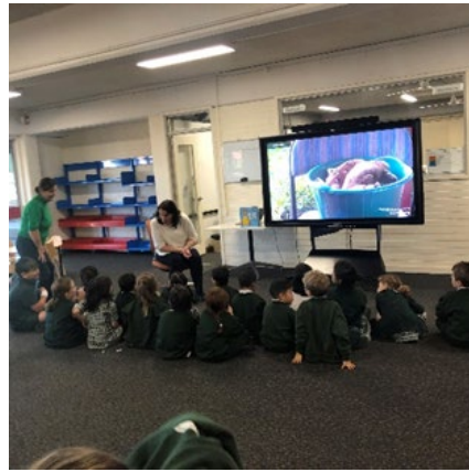
Watching a live sloth