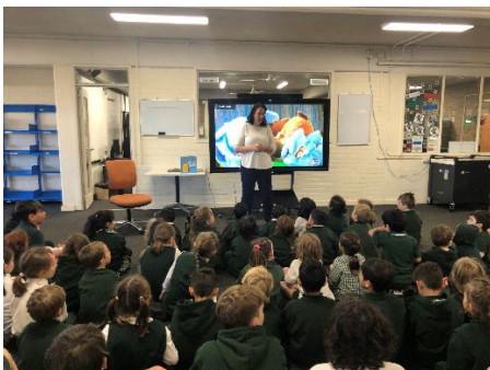
Talking about the book